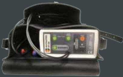
HM190 T/C attachment unit including leather case